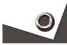
FIXING: METAL HOLE