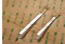
CONNECTION: SOLDERING RIBBON