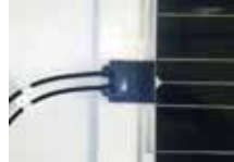
CONNECTION: JUNCTION BOX