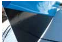
FIXING: DOUBLE SIDED TAPE